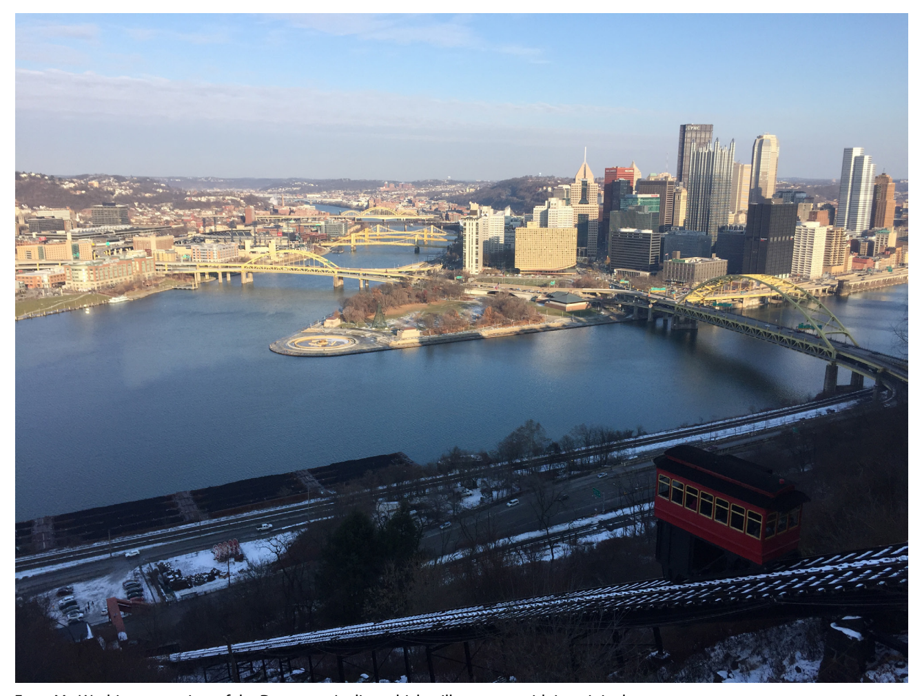
From Mt. Washington, a view of the Duquesne Incline which still operates with its original cars.

download a Pittsburgh transit app to track arrivals and departures in real time ("Momego" is a good one).