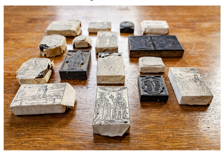
Examples of woodcut printing blocks from the Propaganda Fide press.

The nine-millionth volume recently acquired by the University Libraries at the University of North Carolina-Chapel Hill isn't a book. It's a collection of approximately 900 woodcut print-