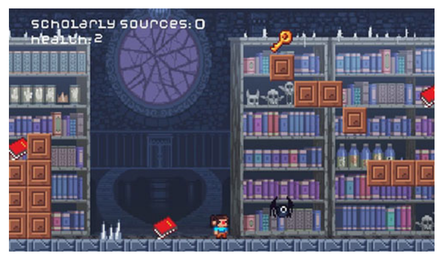
Figure 2. Screenshot of Flowlab minigame.

coding or programming experience. The Flowlab website contains extensive help sections, from video tutorials to online forums. There are also many built-in basic behaviors and visual assets that can serve as an easy starting point for new creators. Although there is a free version of