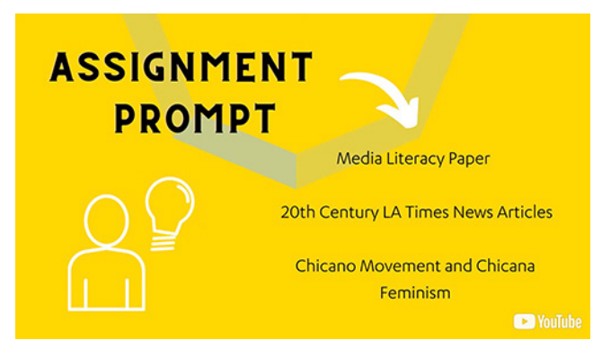
Image 2: A screen capture from the second tutorial, titled "Using the Digital Library: Finding Sources," which provides a sample assignment prompt that can be used to search within the beta site.