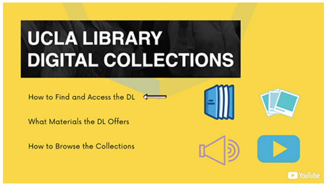
Image 3: A screen capture providing an overview of the scope for the first tutorial titled "Using the Digital Library: An Introduction."

history interviews.<sup>10</sup> Further, we will continue to seek out collaborations, expanding across campus and looking toward our campus teaching support partners, such as the Center for the Advancement of Teaching (CAT) and the UCLA Online Teaching and Learning Initiative to share and market the resources at teaching forums, within CAT newsletters, and with instructional designers supporting course design at UCLA. In January 2021,