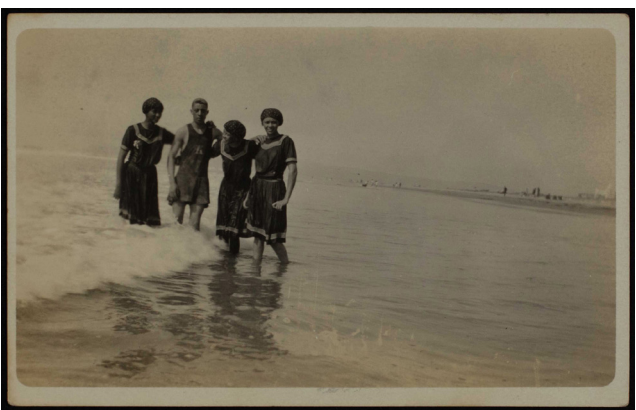
A day at the beach in San Diego, California, circa 1930, from the Turner Collection. Image courtesy of UC San Diego Library, Special

resource in development, The Biosystems Engineering Digital Library, will provide more teaching and learning resources instructors can use in the classroom. Learn more at https://vtechworks.lib.vt.edu