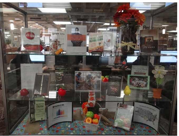
tage months Good Food Revolution Display, QCC Library.

ly I needed to change out the display cases, I waited for inspiration to hit. As the end of the fall semester and the calendar year approached, and with the final season of Game of Thrones on the horizon, I toyed with doing a "winter is coming" display that could include the books from the series, anything related to winter