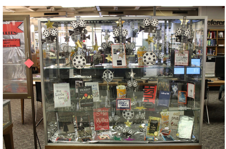
Page to Screen Display, QCC Library.

assembled life-sized vintage boxes of popular movie theater candy (Goobers, Raisinets. Iunior Mints), and found glitter foam stars and shiny silver wrapping paper at a local dollar store. To simulate