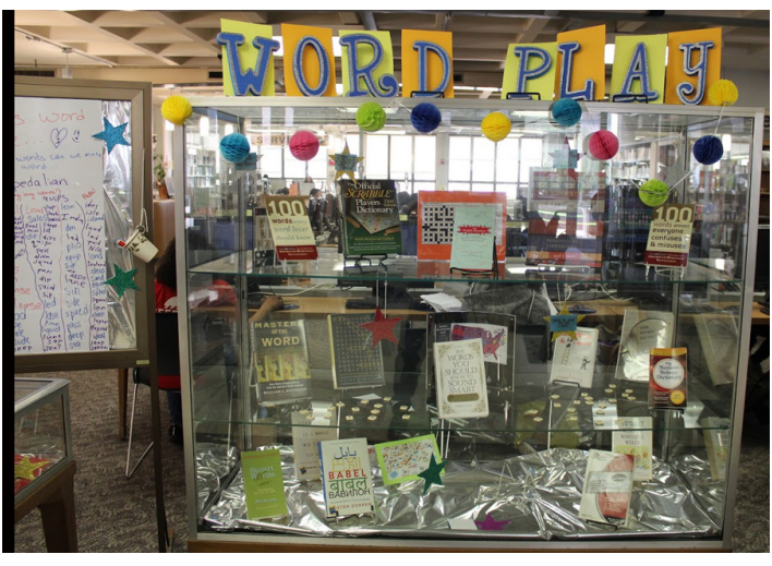
Word Play Display, QCC Library.

As with the transition from the "Common Read" display to the "Page to Screen" dis-