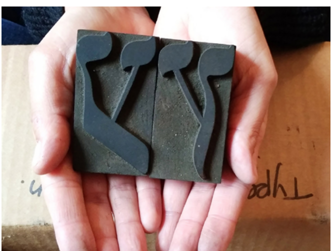
American These Hebrew wood type letters spell the word "wood." The letters press in major cities like New York These Hebrew wood type letters spell the word "wood." The letters are part of a rare collection of 30 different Hebrew wood type alphabets housed at the Cary Graphics Arts Collection.

European Jewish refugees arrived in the United States in the late 19th / early 20th centuries and created a thriving Jewishpress in maior cities like New York. Philadel-