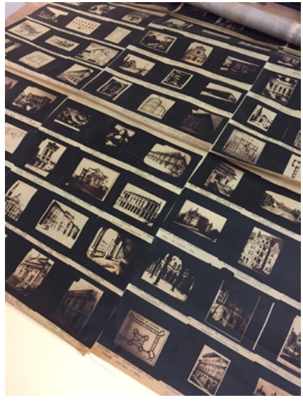
related to Mendel Glick- Glass slides from the University of Okla-

constraints will make cross-department and cross-institution collaboration even more attractive. Calvert concludes. "Current events largely amplify pressures and opportunities for research libraries to mindfully and collaboratively adopt and shape emerging technologies to advance the mission in support of learning and research."