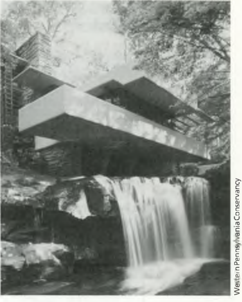
Fallingwater-Frank Lloyd Wright's masterpiece.

Political Correctness Meets Netiquette: New Frontiers for Intellectual Freedom in the Academic Setting