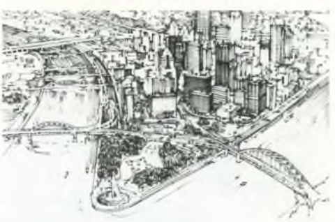
Downtown Pittsburgh's "Golden Triangle"