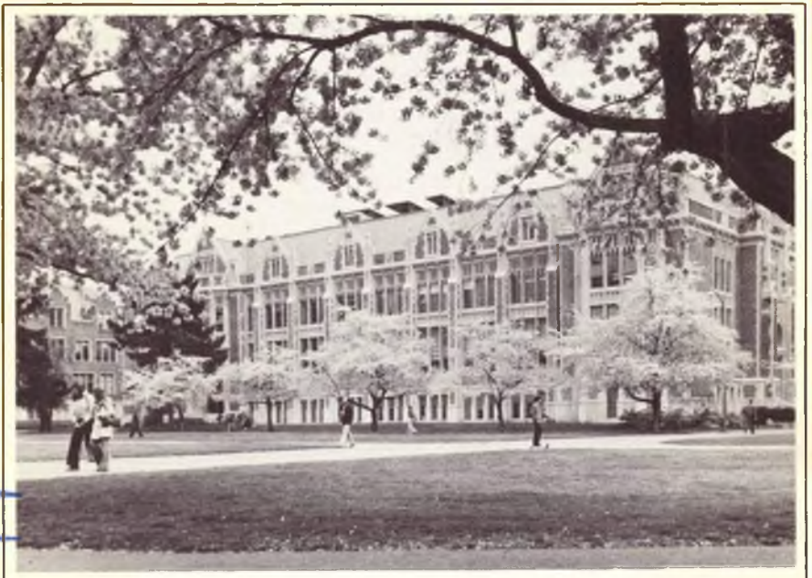
Spring cherry blossoms on the University of Washington campus, Seattle.