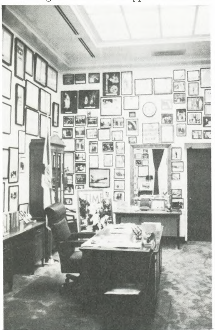
Replicated office of Rep. Claude Pepper, Florida State University.