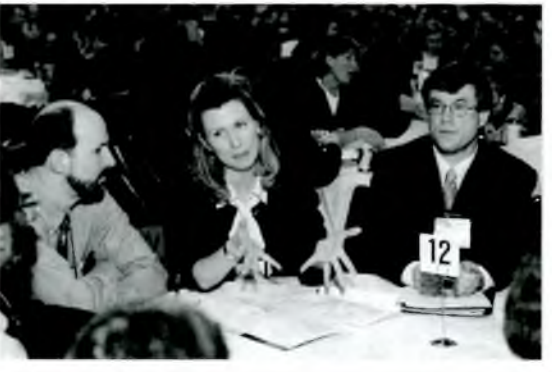
Poster sessions offered attendees the opportunity to chat informally about issues important to them.

Teaching portfolios have been used in education for over 20 years, partly as an alternative means of assessing student achievement. For librarians, portfolios create a context to relate what they do to the mission and goals of their library and institution. They might provide evidence to