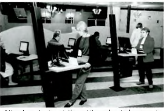
Attendees check out the cutting-edge technology in the Virtual Village Communications Center at the Public Library of Charlotte and Mecklenburg County during the All-Conference Reception.

The shift from an inward focus on ourselves as librarians to an outward focus on our learners and