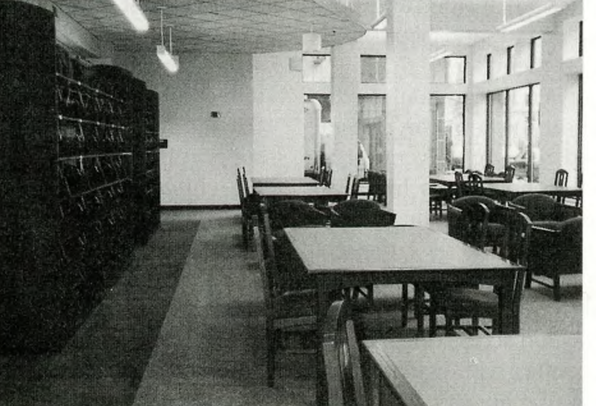
The newly completed library.

Stress is a major factor in change of any kind. At the end of the move, it was important to lower the level of stress. Some of this was accomplished by shortening the work day to normal hours and getting