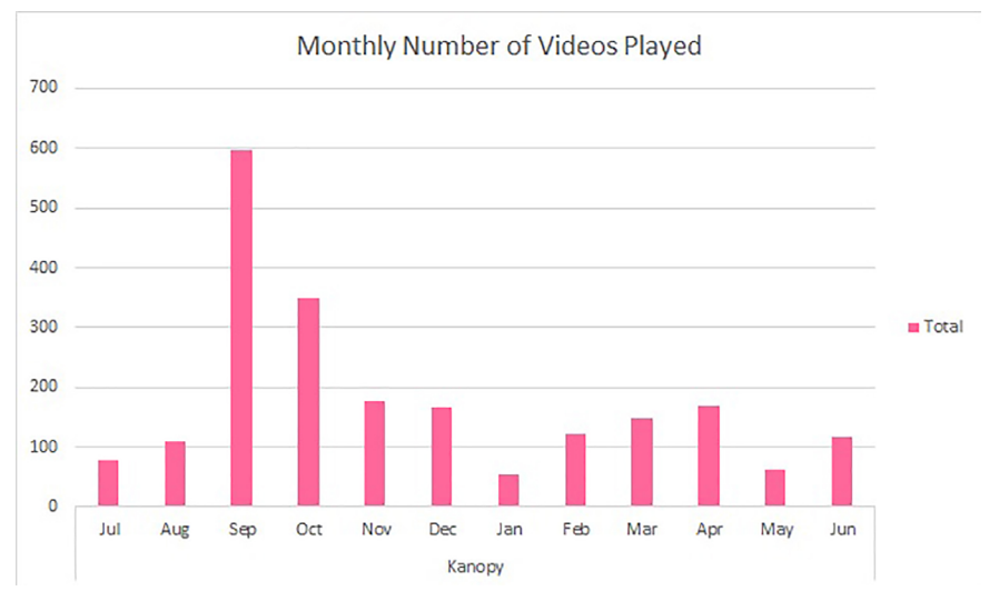
Figure 2. Monthly number of videos played.

form and were using it in a manner that was fiscally sustainable for us (figure 2).