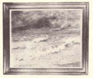
C-108 AUGUSTE RENOIR: "The Wave".