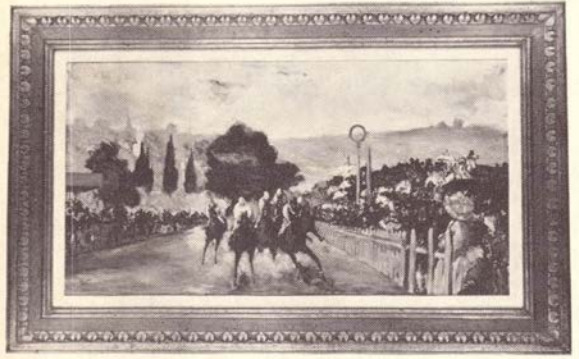
C-104 EDOUARD MANET: "The Races at Longchamp". 1864