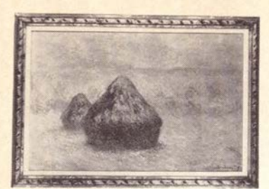
C-106 CLAUDE MONET: "Haystacks, Setting