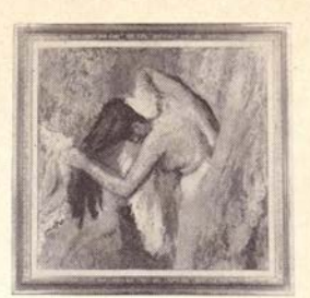
C-103 EDGAR DEGAS: "Woman at her Toilette". 1903