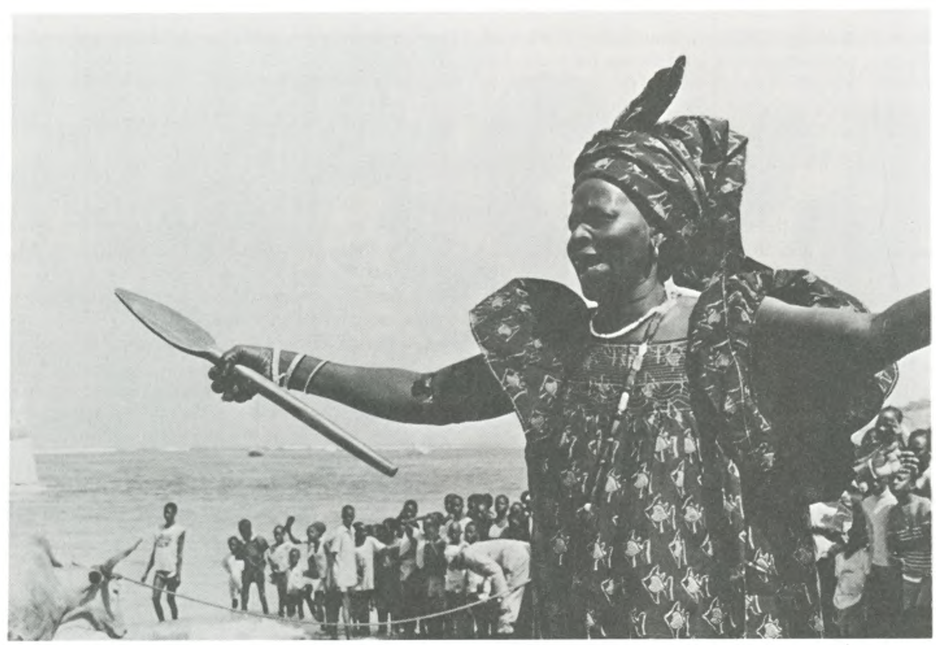
A healer in a Doep ceremony in Senegal.