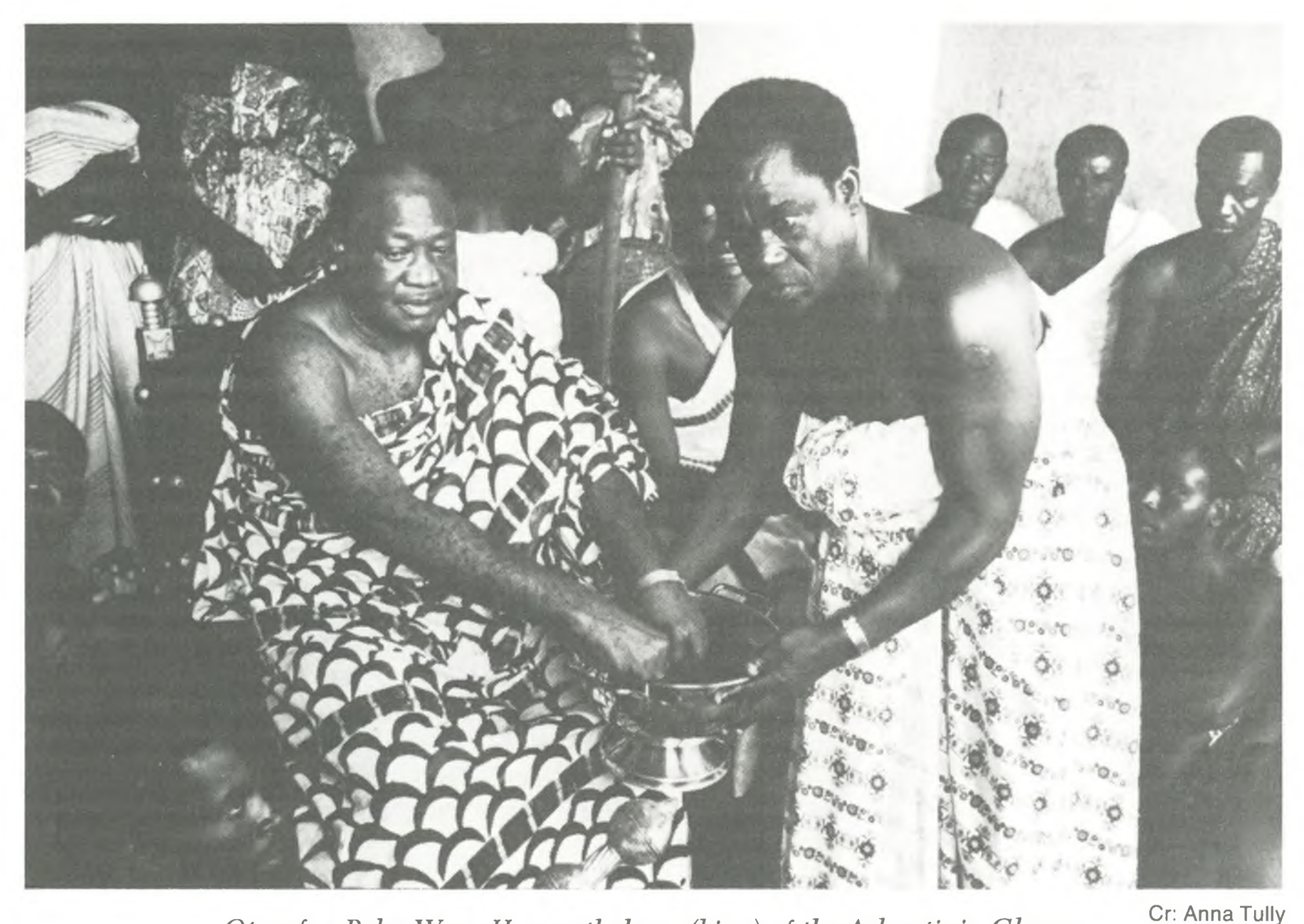
Otumfuo Poku Ware II, asanthehene (king) of the Ashantis in Ghana.

into its review essays. Recent examples are Reed Coughlan's "Ethnicity and the State: Five Perspectives," Choice 23, no.3 (1985):409–18, and Deane W. Ferm's "Third World Liberation Theology: A Bibliographic Survey," Choice 22, no.9 (1985):1446–59.