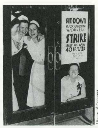
Woolworth workers strike for a 40-hour work week in 1937. (From The ABC-CLIO Companion to Women's Progress in America .)