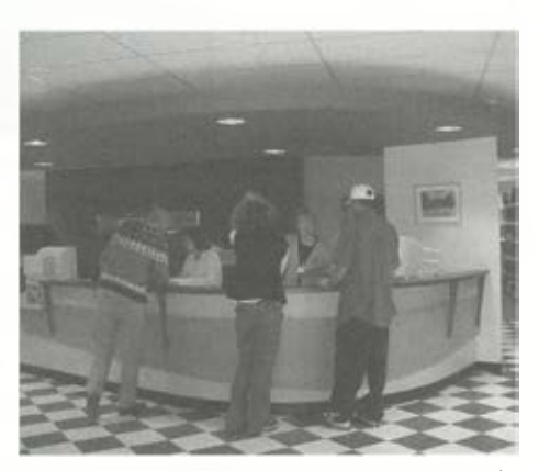
One of the service desks at the University of Calgary's new Information Commons, which includes 260 workstations.

-Reprinted with permission from the UCR (University of California, Riverside) Library News, vol. 26, no. 9, Sept. 27, 1999