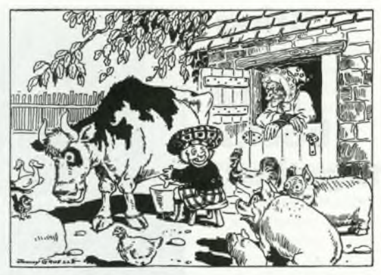
The Wee, Wee Mannie and the Big, Big Coo from My Bookbouse—In the Nursery (1925) at U of I-Urbana.

Let's also look for additional ways to bring users into the library to expose them to our services. Our library houses the offices for the new campus universal I.D. card, named One-Card. Our library faculty had initially engaged in lively