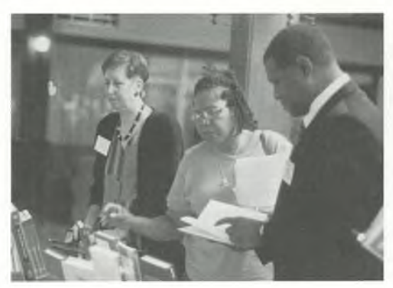
Attendees enjoy a book sale at the conference.

multicultural interaction session performed by Loaves and Fish Traveling Repertory Company engaged the audience in role-playing. The conference fostered networking among speakers and attendees with several opportunities for socializing including during a book sale and author signing after dinner.