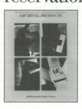
Call for a complete catalog