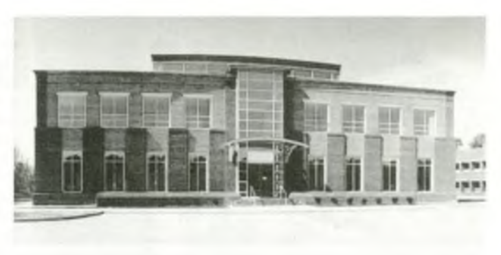
One of the buildings at the new Bruton Heights School Education Center in Colonial Williamsburg, Virginia.

of Regents at the University System of Georgia (USG) to provide detailed collection analysis and other database services to 34 state academic libraries in Georgia. The project is being directed by the Regents Academic Committee on Libraries of USG and is being performed in conjunction with the highly successful GALILEO (Georgia Library Learning Online) initiative, which provides a wide variety of information re-