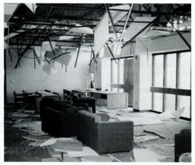
Part of the University of California, Northridge, Library after the earthquake on January 17.

The Clinton administration's Information Infrastructure Task Force (IITF) announced on December 16, 1993, the operation of a computer bulletin board system. The purpose is to pro-