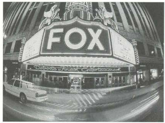
Built in 1928 in the tradition of great movie palaces, this magnificent theater was beautifully restored in 1988 and offers the finest in entertainment from concerts and musicals to magicians and ice shows.

beer blue collar. Pewabic pottery, founded during the Arts and Crafts Movement, is rooted in tradition and elegance. You're quite happy to see that there are public installations throughout the city, and, if you could afford it, you'd plaster the tiles throughout your house. Maybe a small tile as a souvenir is in order.