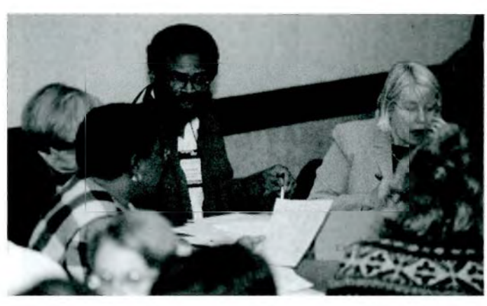
Workshops—a new program feature—gave attendees the opportunity to interact with each other and the speakers.

Special attention is focused on the joint serials archive, with each member "assuming responsibility for maintaining and providing access to selected journal backfiles so