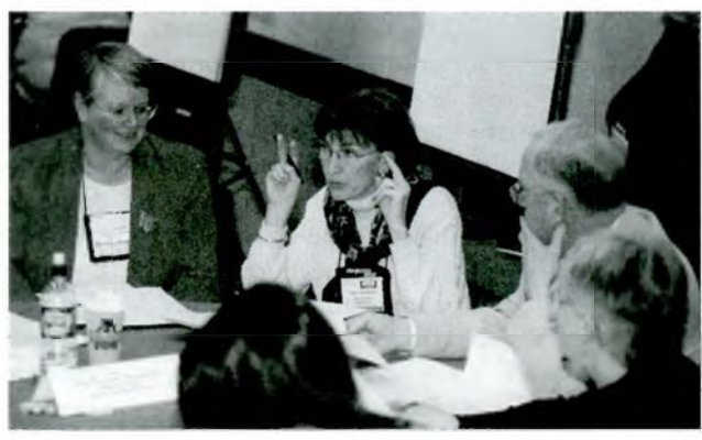
Interactive learning was an important element of ACRL's program sessions.

Examples include standardized tests, surveys, and statistics. They are important and necessary but are also limited in what they can assess. Indeed, they do not assess the activities in which libraries are increasingly involved. Pomo tools complement traditional assessment by measuring trends, examining processes, emphasizing holism, and allowing for dynamic conditions. Focus groups, interviews, observation, and portfolios allow individual, open-ended responses to be seen in the aggregate. These tools look at relation-