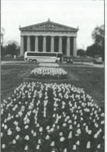
This replica of the Parthenon is the only full-size one in the world.

become a popular convention site for associations and meetings of all kinds. ACRL's 8th National Conference site is headquartered in the heart of downtown Nashville at the Convention Center and the adjoining Renaissance Hotel. Other hotels, along with restaurants, shops, and a variety of entertainment options, are available within walking distance. A short ride by