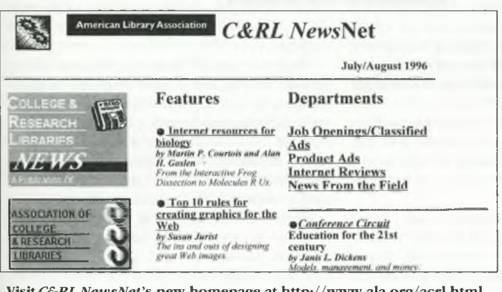
Visit C&RL NewsNet's new homepage at http://www.ala.org/acrl.html.

Visit ACRL on the Web (http://www.ala.org/ acrl.html) and get access to current information about the association's activities. You can also download standards, guidelines, and forms. ACRL sections with homepages are linked to the ACRL homepage.