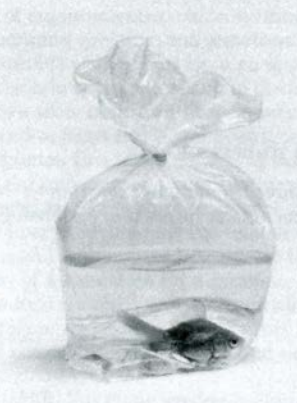
The small customer.