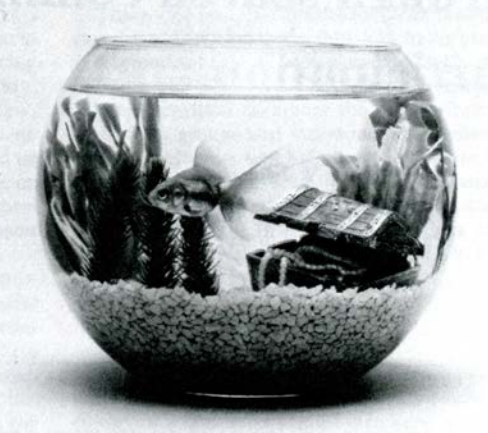
The small customer at Ballen.

With some booksellers, a small customer doesn't rate quite the consideration that a large customer might. But at Ballen, the single book customer receives the same service and services that a thousand book customer does.