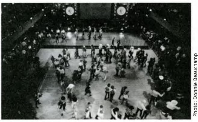
Have fun at the All-Conference Reception, Sunday, April 13, at the Wildhorse Saloon.