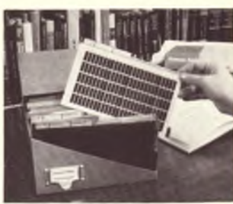
Over 1,100 LC Entries are contained on a single Microfiche card . . millions compressed into a desk-top 20inch Microfiche file.

The new way is the Micrographic Catalog Retrieval System that automates your search and print-out procedures. Basically we have done the filing and look-ups for you, giving you a quick-find index by both LC Card Number and Main Entry. You have only to select the proper Microfiche card from the quick-find index. Insert this card in a Reader-