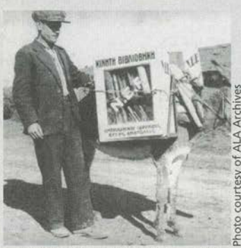
A donkey serves as an early bookmobile for the American Institute in Anatolia.

memorative brochures, signs, forms, and catalog and library cards from public,