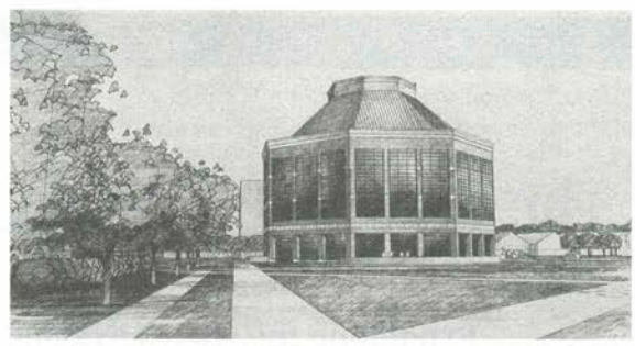
A rendering of the University of Illinois's new Agricultural, Consumer and Environmental Sciences Library, Information and Alumni Center.

The State of Washington Community and Technical College system, Wake Forest University, and the University of Wisconsin System have all selected Endeavor Information System's Voyager integrated library and information access system. In addition to its single customers, Endeavor now claims as customers nine consortiums and two statewide systems—Georgia and Wisconsin.