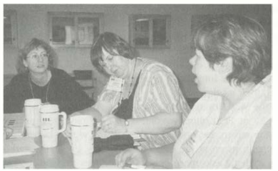
Participants share ideas during Immersion '99.

ACRL's Institute for Information Literacy plans to hold Immersion '00 at the University of Washington August 4-9, 2000. It is intended for new librarians or instruction librarians wanting to develop their individual instruction skills (Track I) as well as those who want to develop/advance an information literacy program for their institution (Track II). Attendees are selected through a competitive application process. Application instructions will be posted on the Web in October at http://www.ala.org/acrl/nili/initiatives.html.