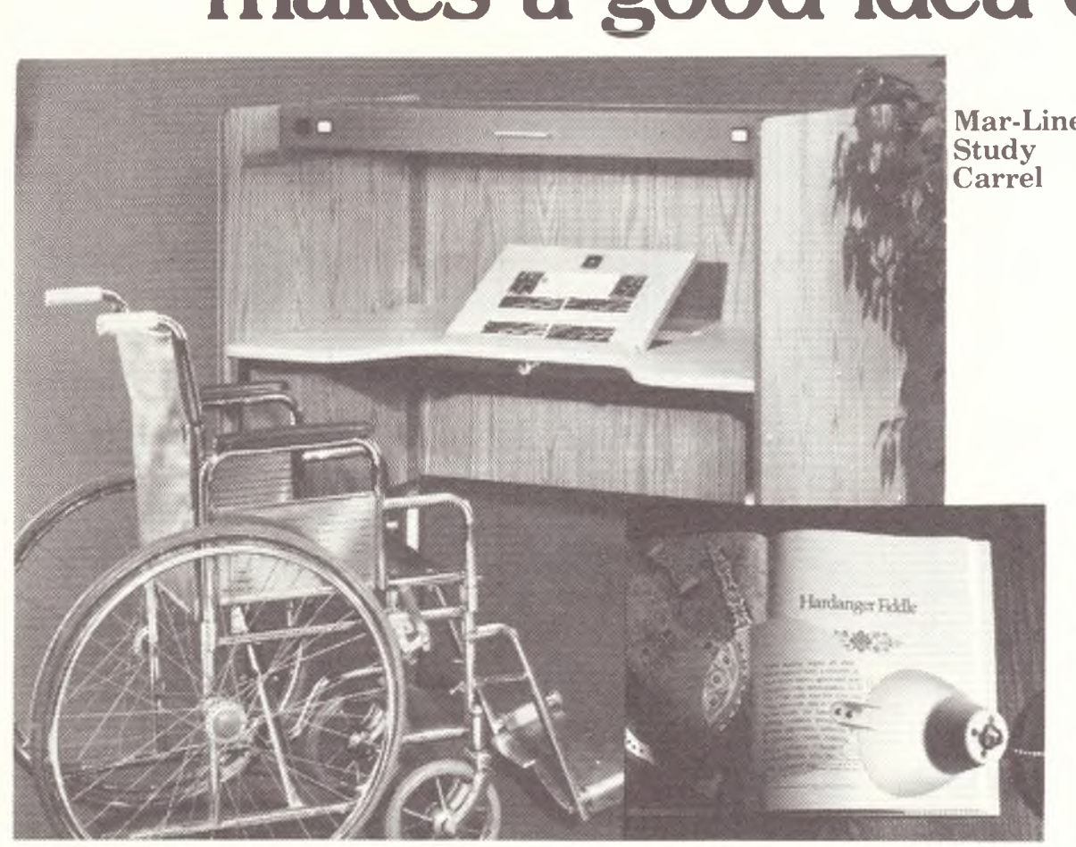
Magnifying Lamp Unit

Open your library to all your patrons, with specially designed products from Gaylord. Readers with impaired sight will welcome distortion-free Magnifying Lamps and compact Master Lens® units. The Mar-Line® Study Carrel is wheelchair-accessible and offers adjustable lighting and study surface. And wheelchair users will appreciate Mar-Line Displayers that bring periodicals, paperbacks, newspapers, cassettes and record albums within easy reach. For more information see pages 62 and 63 in the new '81-'82 Gaylord catalog or call toll-free 800-448-6160.