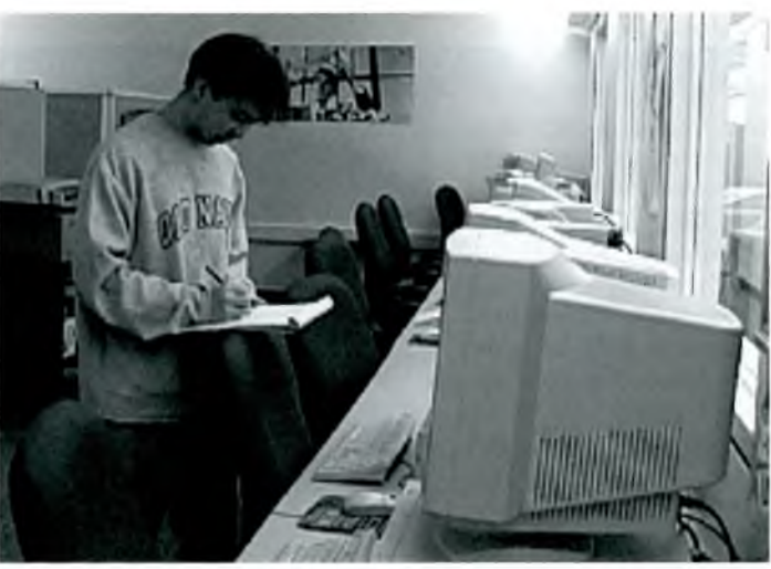
Northwestern's new facility offers one-stop shopping for faculty interested in everything from collection development to offering a course on the Web.

The exhibit was made possible through the support of the National Endowment for the Humanities. The original version of this exhibition was developed by the SITES and was made possible by Nissan North America. The exhibition is part of America's Jazz Heritage, A Partnership of the Lila Wallace-Reader's Digest Fund and the Smithsonian Institution.