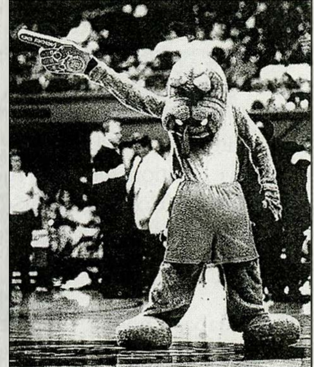
Doggone it! Keep that food and drink out of the library.

Food + drinks in libraries = pests + damage. Librarians everywher e are concerned with this problem: patrons who bring in food and drinks that attract pests that destroy library materials. One solution to the problem is a "No food, No drinks" campaign.