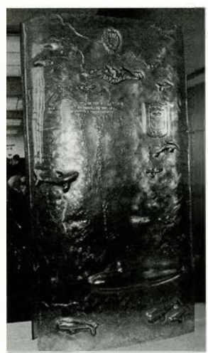
This glass sculpture given to the U.S. Naval Academy honors two nuclear submarines lost at sea.

about submarines and submarine warfare was recently donated to the Nimitz Library, U.S. Naval Academy, by the family of the late Tho-