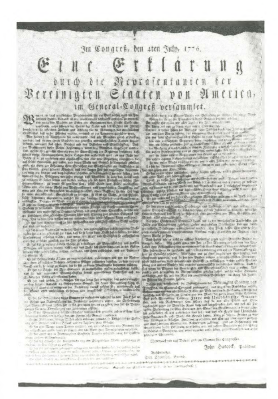
Declaration of Independence in German, 1776.