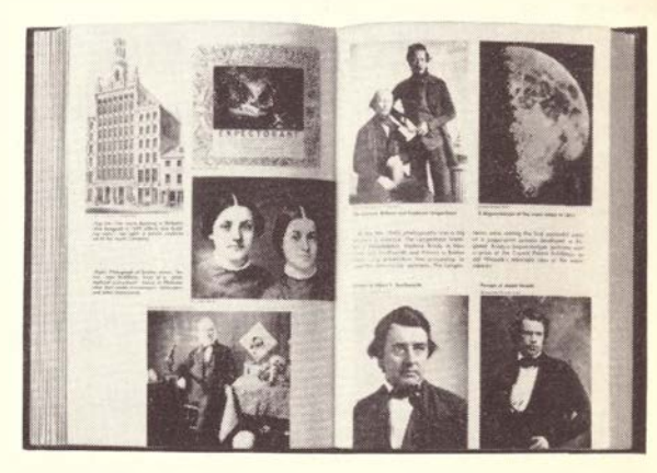
Pages from The Annals of America, new 20-volume chronological collection of American source materials (1493 to present), which will be included in UMF form with The Library of American Civilization.

Britannica's Comprehensive Editorial Plan assures that each library will be a definitive and highly useful collection. The first Library in the UMF series—the Library of American Civilization—and subsequent Libraries will be made up of materials selected by area specialists according to strict criteria, and will include complete catalogs, topical bibliographies and research guides.