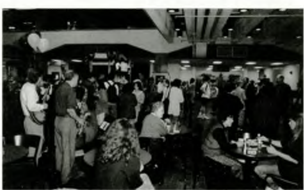
Students at the University of Louisville gained access to a new library service—a cafe in the Ekstrom Library Lobby. Librarians worked with Chartwell Food Services to create the cafe, which offers specialty coffees, biscotti, scones, juice, etc. The cafe is quite popular and the cafe tables are often filled with faculty, staff, and students engaged in conversation.

The group hopes to encourage representatives of digital library programs support-