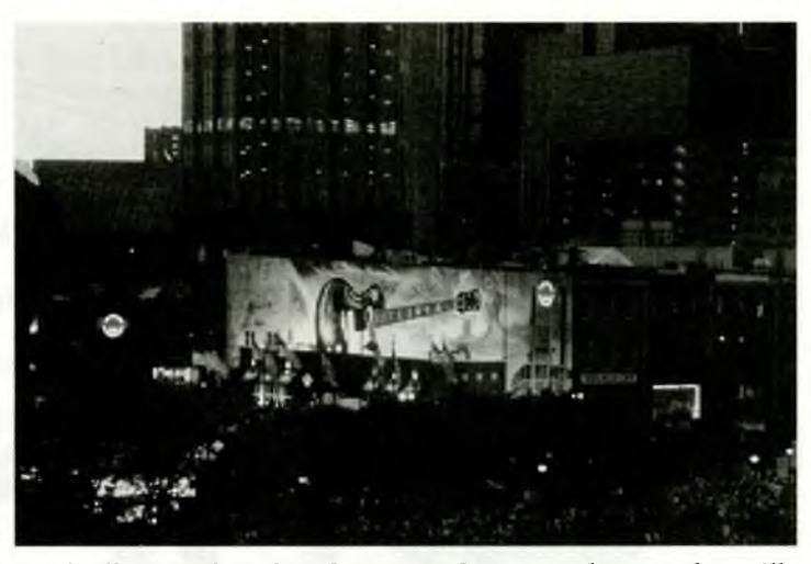
Nashville's Hard Rock Cafe is one of many nightspots that will tempt ACRL conference-goers in April.

For those with time, wheels, and/or a sense of adventure, there are some restaurants located further away from downtown that are worth