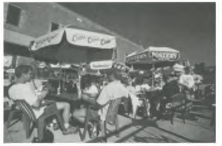
With more than 300 days of sunshine a year in Denver, and more than 80 brew pubs, restaurants, and sports bars, LoDo is a great place to pass some time.