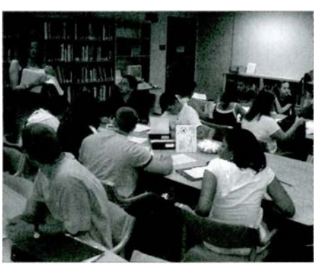
An example of one of the more than 500 classes taught in the University of Louisville Libraries annually to instruct honor students in information skills. This group of honor students is involved in resource-based learning.

demic libraries and how these challenges can be met. They described the scholarly communication environment and academic librarians' role within it, and they provided ten axioms for academic librarians to help them be successful in this new century. Most important, the article ad-