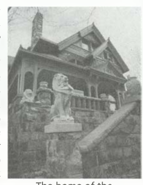
The home of the Unsinkable Molly Brown.

Other Denver attractions include Colorado's Ocean Journey , featuring 15,000 water and land creatures, including native Colo-