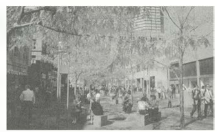
Meet your shopping needs at the 16th Street Mall.