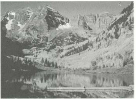
A look at the majestic Maroon Bells mountains in Aspen.

impressive Coors Field [(303) 312-2108], designed to look like an old-fashioned ballpark. The Super Bowl-winning Broncos , won't be playing in March, and their 76,000 seat stadium won't be quite complete by conference time, but pick up a t-shirt while you're here!