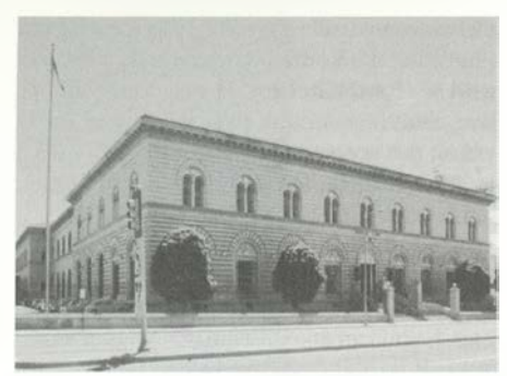
Plan a visit to the U.S. Mint, one of only four in the United States.

rado fish, sea otters, zebra sharks, and Sumatran tigers. Another enjoyable destination is the U.S. Mint, one of only four mints in the United States. The Mint, which makes coins of all denominations, has free weekday tours of the facility [320 W. Colfax Avenue, (303) 405-4791].