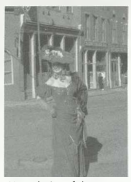
Your choice of the opera or gambling is available at Central City.

the unique community of Boulder, where the New Age is old news, the stunning Flatirons tempt rock climbers, and evervone seems impossibly healthy. The magnificent Rocky Mountain National Park [(970) 586-1206] is northwest of