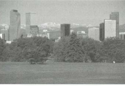
Scenes of the breathtaking Denver skyline.

Larimer Square moves seamlessly into the shops and eateries of Writer's Square and