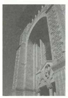
and seismic upgrade. The 172,000-squarefoot Bing Wing occupies a 1919 building. designed by the famed San Francisco architectural firm Bakewell & Brown. The reconstruction, which used Fields & Devereaux Architects and Engineers, and cost nearly $50 million, involved a full earthquake retrofit of the main library build-

Stanford University Libraries reinaugurated its old main library as the Bing Wing of the Cecil H. Green Library, following an extensive restoration