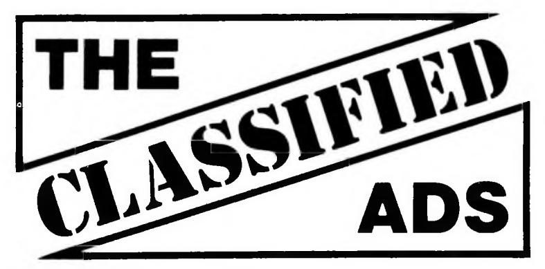
Deadlines: Orders for regular classified advertisements must reach the ACRL office on or before the second of the month preceding publication of the issue (e.g. September 2 for the October issue). Late job listings will be accepted on a space-available basis after the second of the month.

12-16—British Libraries: A visit to some wellknown libraries in the English Midlands before the 1987 IFLA meeting at Brighton. The tour will begin at Heathrow and Gatwick Airports on the morning of August 12. The tour will visit academic, public, endowed, subscription, parochial, cathedral, private, and learned society libraries. Accommodations for four nights will be in both modern and traditional hotels. Fee: £200 (about $300) per person sharing; £30 supplement (about $45) for a single room. This will cover bed, breakfast, evening meal, transportation, and all incidental costs. A reservation may be secured by sending $50 (payable to GSLIS CE Fund) to: Donald G. Davis Jr., Graduate School of Library and Information Science, University of Texas, Austin, TX 78712-1276; (512) 471-3821.