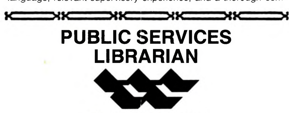
Wayne State University

part-time staff members. In addition to an accredited MLS, requirements are: ability to work effectively with staff in other library units and with library users, ability to plan effectively, evidence of creativity and initiative, reading knowledge of one modern western European language, relevant supervisory experience, and a thorough com-