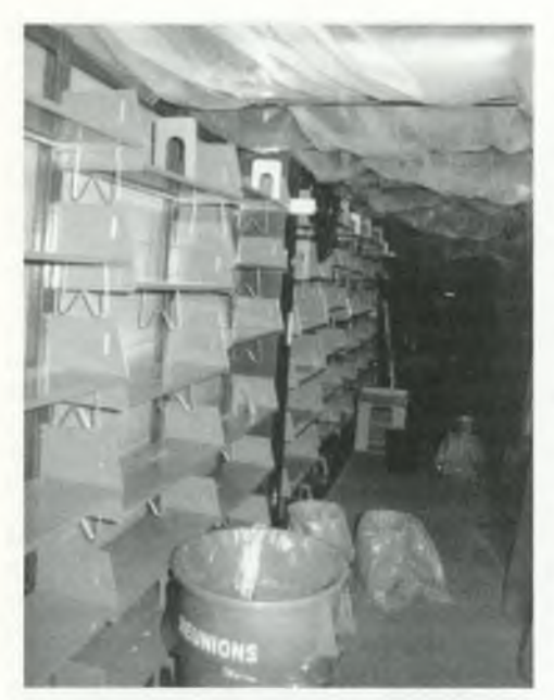
Be prepared for disaster! Water damage like this can happen when you least expect it.

• Strongly recommend that your institution create a Disaster Committee or Response Team. The members can be appointed or volunteers; but all should be interested in preservation of library materials. Do not ignore other risk management experts on campus; they can be valuable additions to the group.