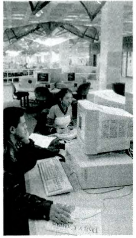
UConn Libraries Information Cafes

"Honoring the Past, Building for the Future"