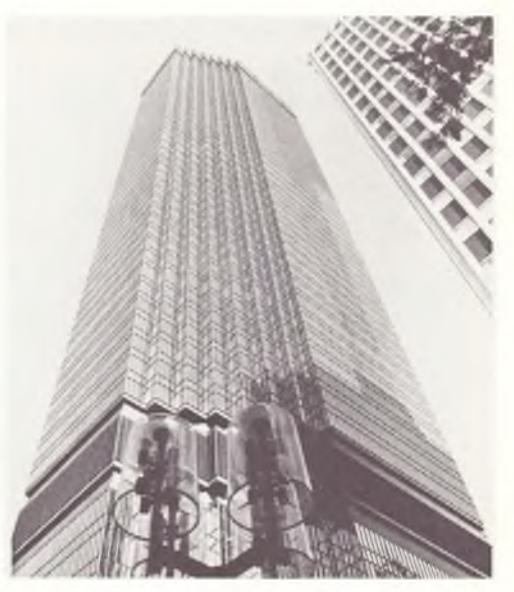
The 57 story IDS building dominates the skyline of downtown Minneapolis.

This paper discusses the results of a recent study which compared the behavior styles, values and work preferences of catalog and reference librarians employed in 16 large university libraries. The data confirmed differences between university catalog and reference librarians, not only in terms of the nature of the work performed, but also in attitudes, interests, and work preferences. Furthermore, the study revealed that university librarianship as a profession exhibits very distinctive and potentially dysfunctional values and atti-