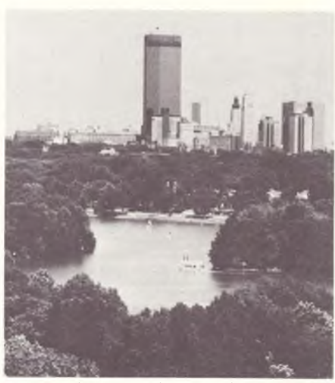
Lake of the Isles offers scenic beauty and recreational enjoyment within minutes of downtown Minneapolis.

Non-librarian guests accompanying a paid conference registrant may attend the Conference for