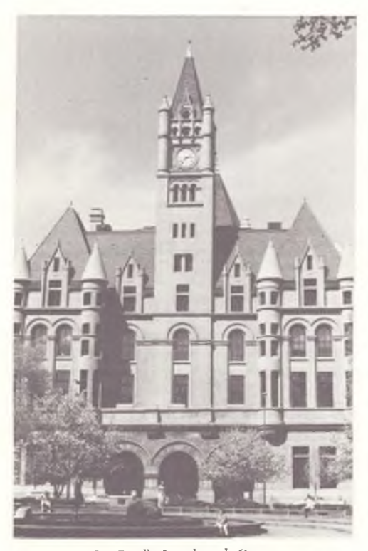
St. Paul's Landmark Center

Landmark Center Reception-St. Paul: All conferees are invited to attend the wine and hors d'oeuvres reception, Friday, October 2, from 6:00 p.m. to 10:00 p.m., at Landmark Center, the restored Old Federal Court Building in downtown St. Paul. This historic court building, now the new cultural arts center, houses five non-profit agencies and sponsors a varied program of performing and visual arts as well as civic activities. The reception will be held in the Cortile, the huge indoor courtvard which rises six floors to a clear skylight. Music will be provided from the balconies. Conferees are encouraged to tour the old courtrooms as well as to stroll across Rice Park and visit the James Jerome Hill Reference Library and the St. Paul Public Library which share a stately building on the National Historic Register. Landmark Center is also within walking distance of the Science Museum of Minnesota which houses the acclaimed Omni Theater. Shuttle buses, leaving approximately every 30 minutes beginning at 6:00 p.m., will take conferees to St. Paul from the Hvatt with return trips beginning at 8:30 p.m.