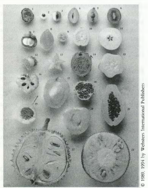
A look at tropical fruit slices from The Book of Food (Henry Holt, 1994).